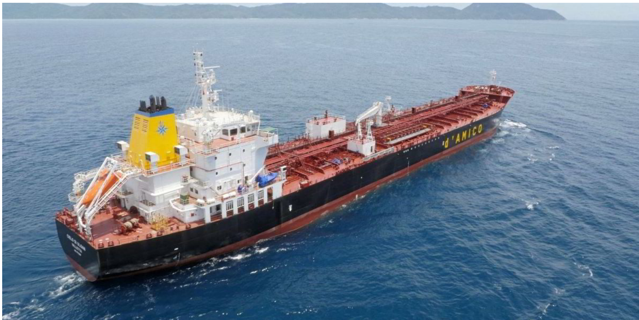
DIS has refinanced five tankers with a new $54m facility.