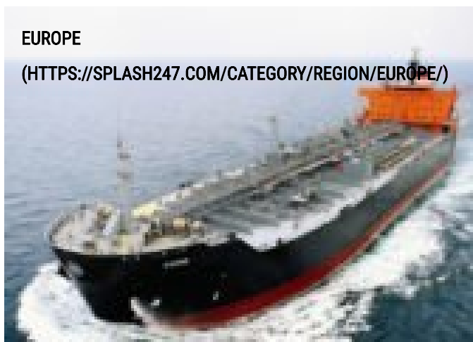
EUROPE ( HTTPS://SPLASH247.COM/CATEGORY/REGION/EUROPE/ )

( https://splash247.com/torm-acquires-four-mr-tankers/ )