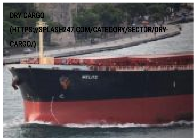
DRY CARGO ( HTTPS://SPLASH247.COM/CATEGORY/SECTOR/DRY-CARGO/ )

Torm acquires four MR tankers ( https://splash247.com/torm-acquires-four-mr-tankers/ )